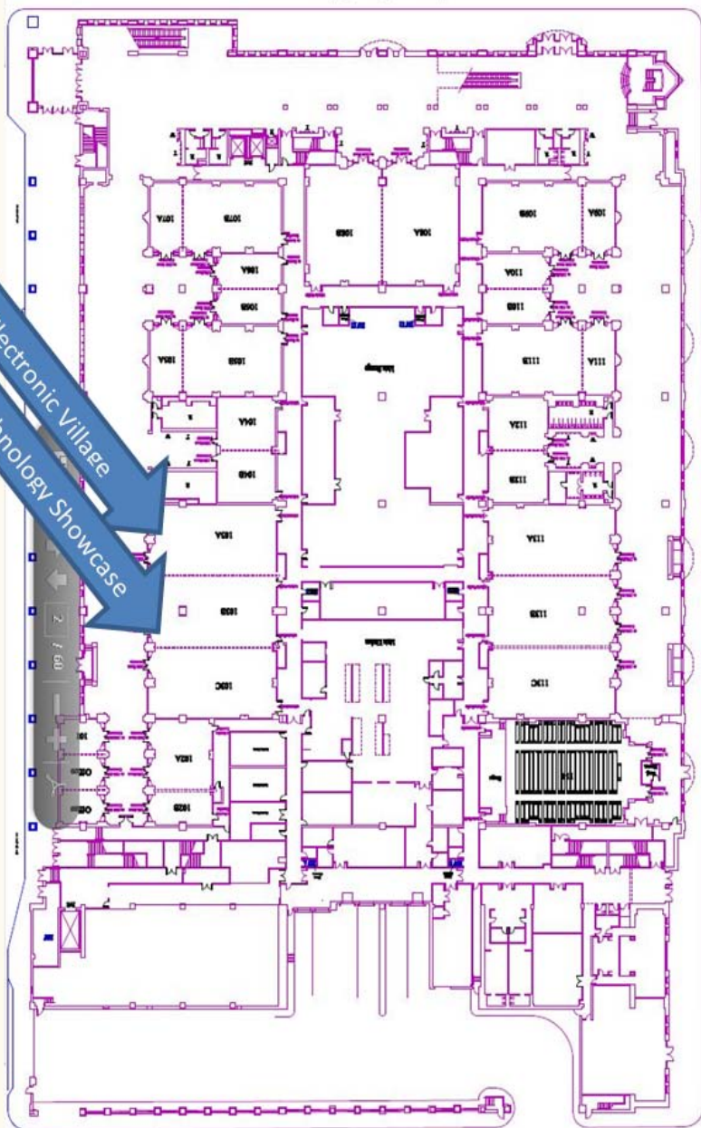
Cover: "Old Liberty Bell," James Cremer (1821–1893). The original stereoscopic view is at the New York Public Library. This image is in the public domain.